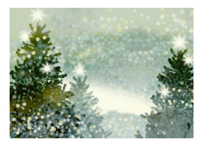
If you don't like how things are, change it! You're not a tree.